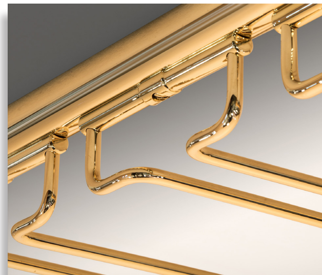
front of Stemware Holder