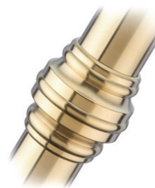
Satin Brass PVD