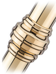
Polished Brass Lacquered