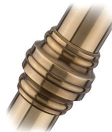
Aged Brass Lacquered