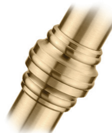
Satin Brass Lacquered

Do Not expose to chemical cleaners, polishes, or abrasive materials, which can compromise this coating and will permanently alter the appearance.