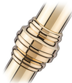
Polished Brass Un-Lacquered