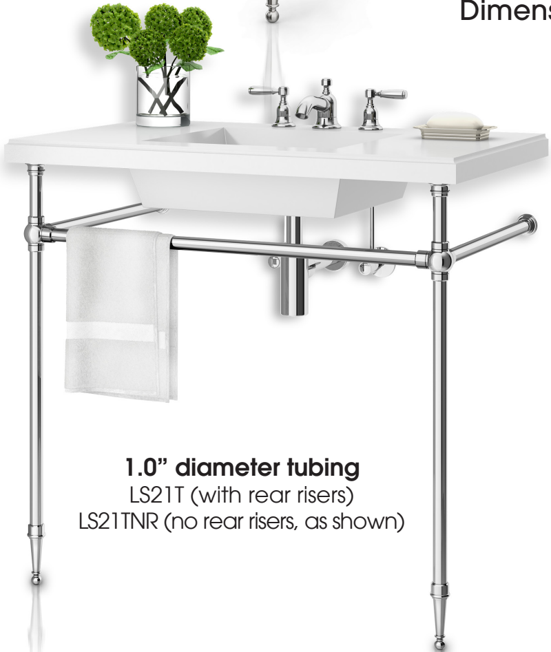
1.0" diameter tubing LS21T (with rear risers) LS21TNR (no rear risers, as shown)