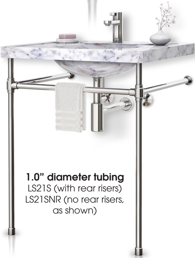
1.0" diameter tubing LS21S (with rear risers) LS21SNR (no rear risers, as shown)