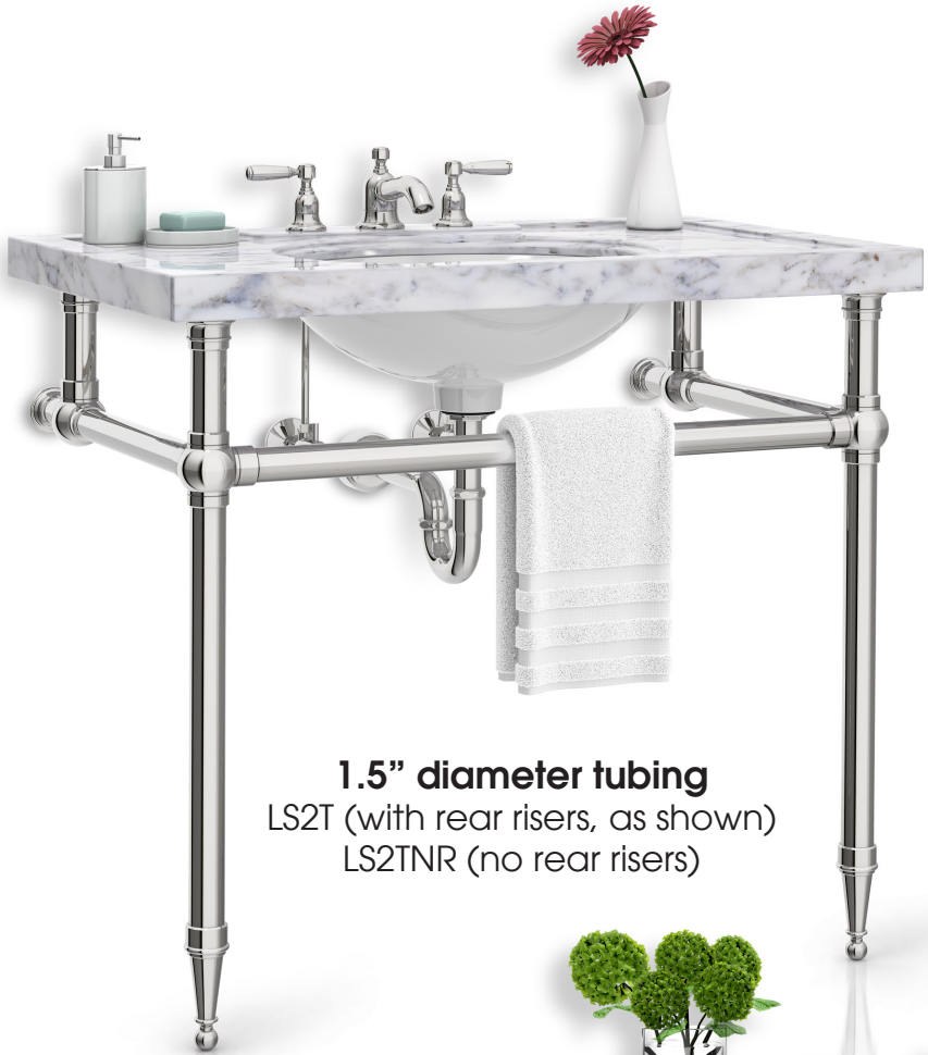
1.5" diameter tubing LS2T (with rear risers, as shown) LS2TNR (no rear risers)

Dimensions: Standard leg size only: 32"w x 22"d x 32"h Leg Systems can be field cut to reduce size